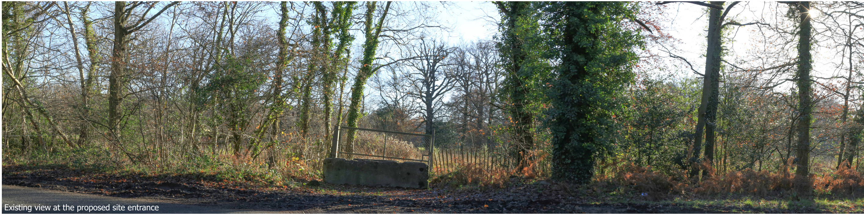
Existing view at the proposed site entrance