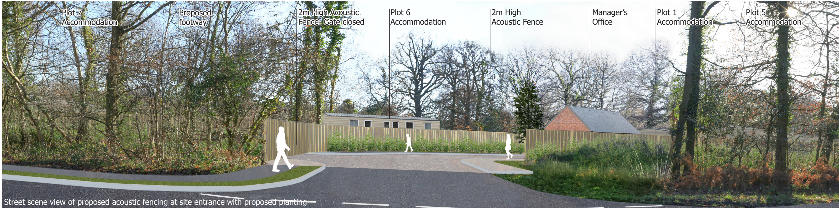
Street scene view of proposed acoustic fencing at site entrance with proposed planting