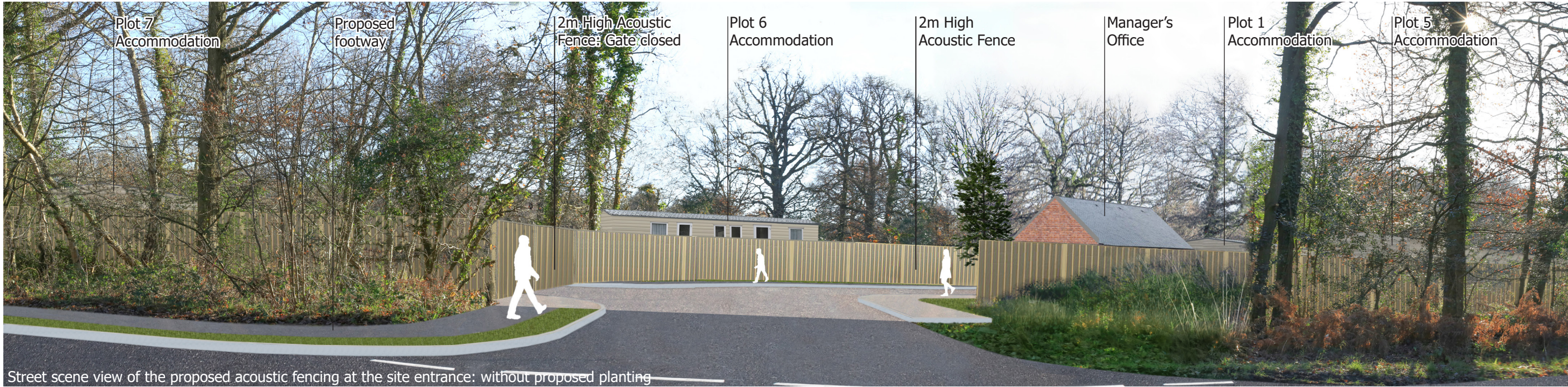
Street scene view of the proposed acoustic fencing at the site entrance: without proposed planting