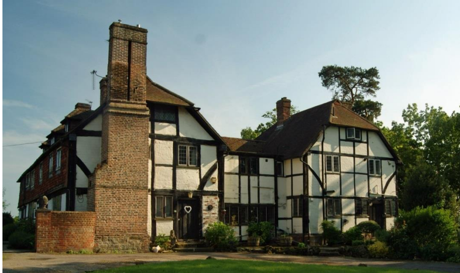
Rowley. A 15C manor house, listed grade 2*. One of 19 listed buildings that would be demolished.